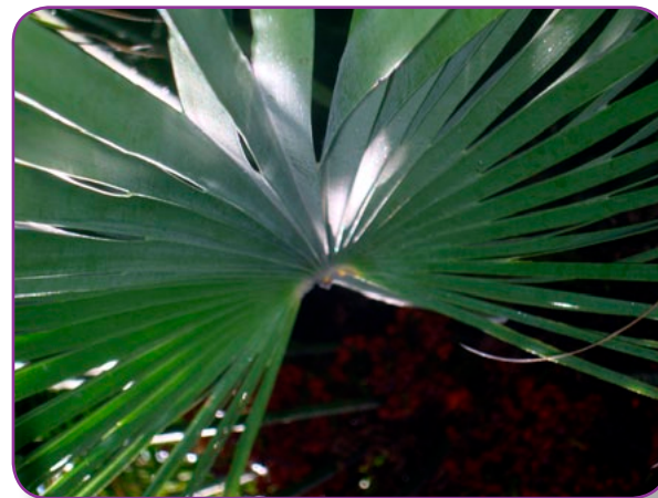
Silvered fronds