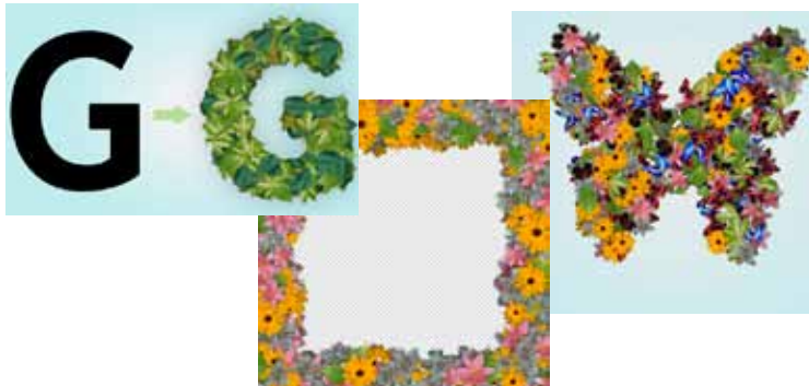
Examples from http://cdn.mightydeals.com/dealimages/DesignBeagle