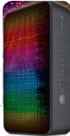
AUD Mini6 Party

Second, the volume through the iPhone tends to distort as the volume increases. If you are having a party, or just listening on your patio, you will want more volume without distortion. The AUD Mini6 Party gives you just that. I tested the frequency response with several of my songs, testing both the distortion at low frequency and at high frequency. I noted some distortion at low frequencies, but none at the high end. The stated frequency response range is 200Hz to 20KHz.